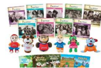
K-8 Kit (3rd Edition)

District Resources and Agency Scope and Sequence Chart :